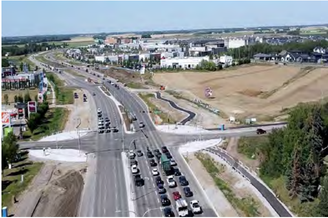
St Albert Trail