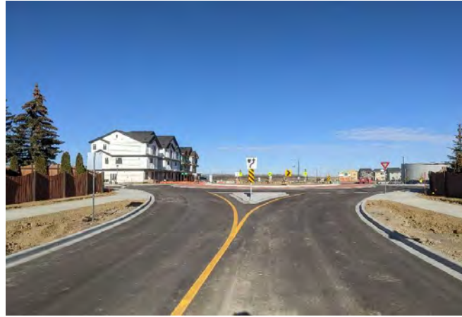
Villeneuve Road Roundabout