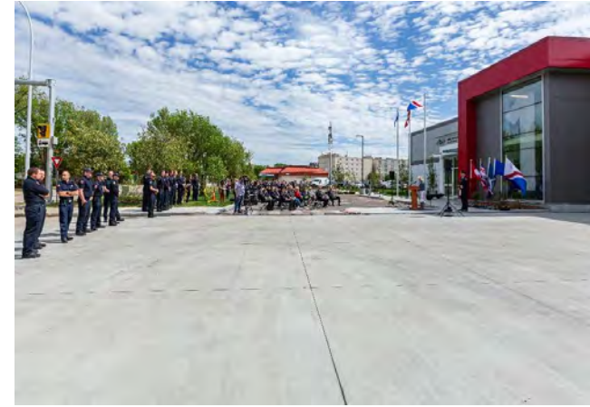
Fire Hall #1